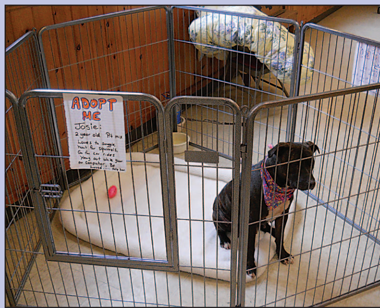
Pit bull Josie hopes to be adopted.

ACCORD – The fund raiser at the Accord Fire District Headquarters on November 13 was to help a charity which finds homes for animals which end up in the local pound, but a lot of the talk was about how to keep animal abusers from adopting them. Live music and pizza fresh from a mobile oven helped bring people to the Have-a-Heart Foundation's event for its animal welfare fund, where Ulster County's proposed animal-abuser registry law was a hot topic.