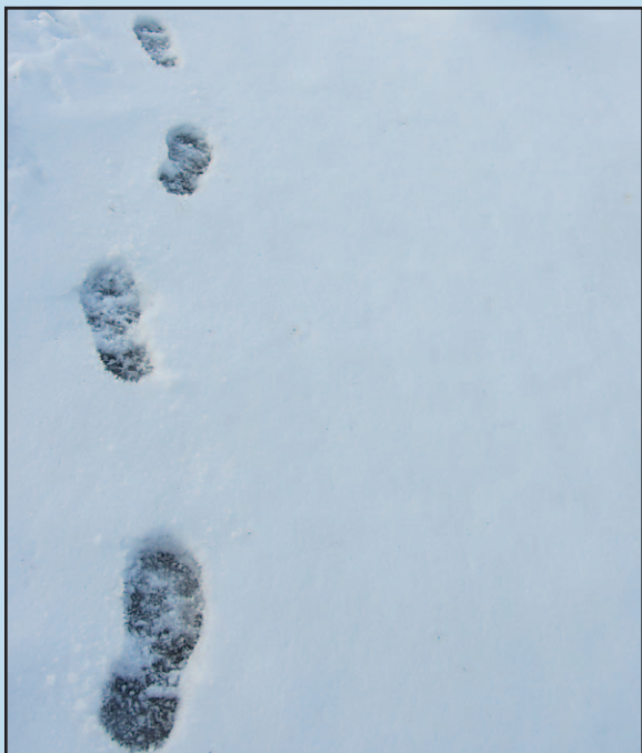
A winter wilderness trek.